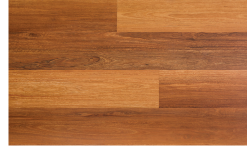
Coolabah Spotted Gum ARN76804